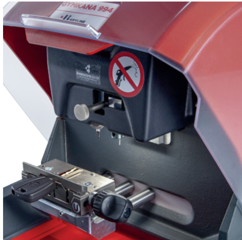
Laser car key cutting