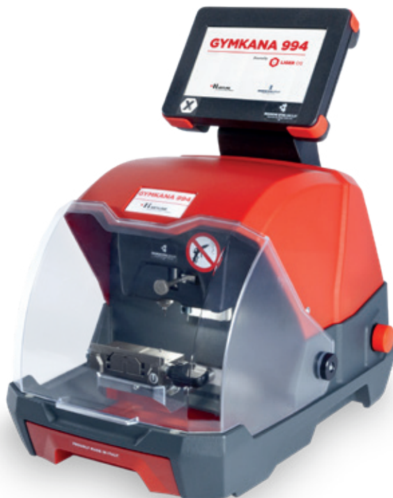
Gymkana 994 with Keyline X console

* A good and stable Internet connection is always required.