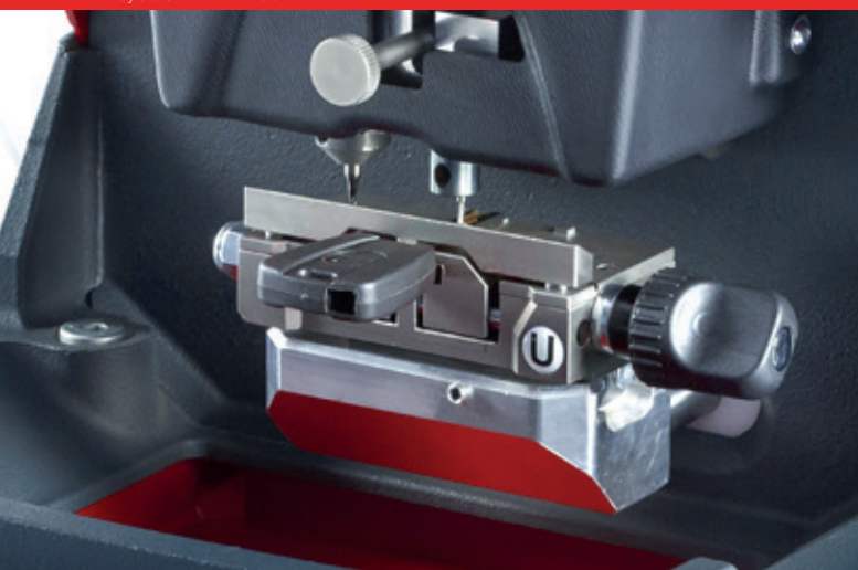
Edge cut car key

New universal self-aligning U clamp, for the majority of laser and double-sided edge cut keys.