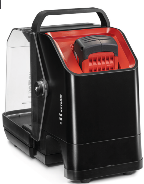
BUILT-IN BATTERY ADAPTOR Messenger® can be powered also by battery

The App can be used through an Android smartphone or tablet, from version 7 and up.